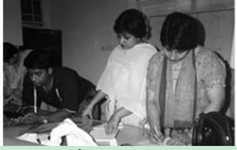
Learning new skills to access new markets

global export market, a producer has to be efficient, prompt, flexible, specialized, and competitive. Market savvy entrepreneurs will expand their businesses by meeting the demands of the ever changing marketplace and identifying niche markets for their products.